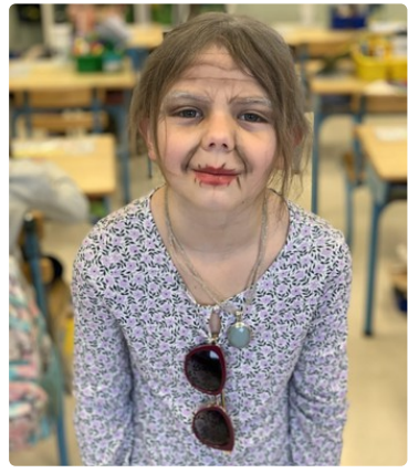
100 Day Celebration