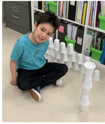
100 Day Celebration