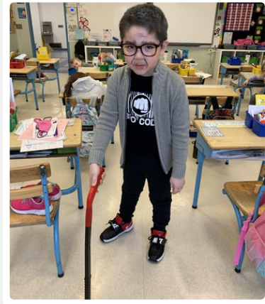
100 Day Celebration